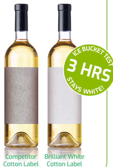
Competitor Cotton Label