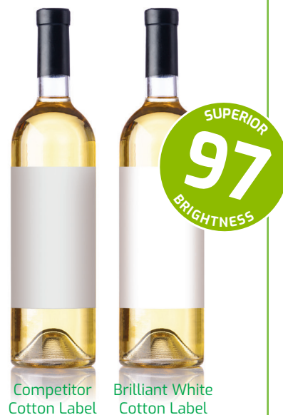
Competitor Cotton Label